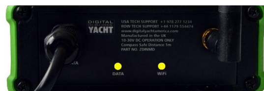
Bottom End Cap