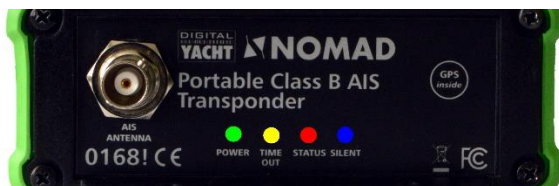
Top End Cap